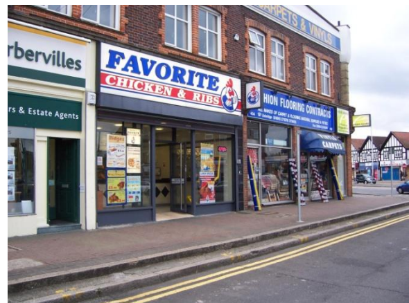
Favourite Chicken & Ribs 1 Western Parade Long Lane Hillingdon Appeal success for 1am opening Mon- Thur. & 2am opening Fri. & Sat.