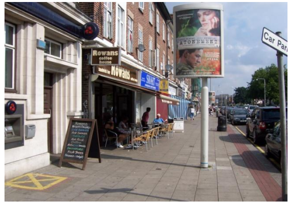
PUBLIC INQUIRY APPEAL WON FOR CONTINUED USE AS RESTAURANT 135-137 HIGH ROAD BARKINGSIDE

We will still negotiate with the Council's Planning Department officers throughout the ever-increasing complex application process on our client's behalf in order to achieve the most favourable permission.