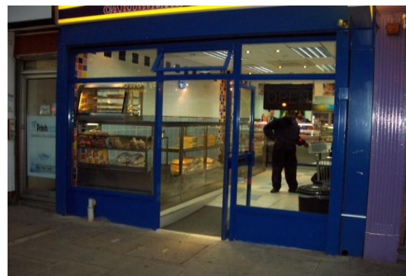
227 Walworth Road London SE17 Appeal win for continued use as hot food take-away