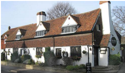
Conservation area Rear extension & first floor flats The Forge House Restaurant, Kent.

Direct Planning employs Chartered Town Planners and Chartered Architectural consultants to advise and act for clients in planning applications, licensing procedures, appeals and all other aspects of architectural & planning advice. Our Town Planners are members of The Royal Town Planning Institute (MRTPI). Our Architects are members of The Royal Institute of British Architects (RIBA). We have dealt with 1000's of applications and appeals for 1000's of clients and because of this Direct Planning have been very successful in a wide variety of projects over the past 24+ years.