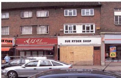
COU to A3 café 142 Crayford Road, Crayford

the key to a successful business is proper planning